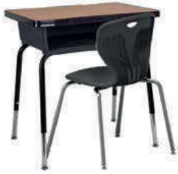
Desk: 600*450*660- 780mmmm Chair: 430*450*460mm