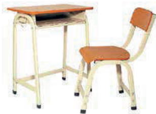
Desk: 600*400*750mm Chair: 360*360*440mm