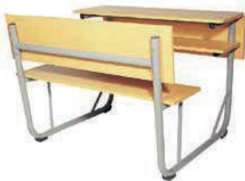
Desk: 1100*400*750mm Chair: 1100*300*440mm