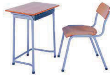
Desk: 600*400*750mm Chair: 395*395*460mm