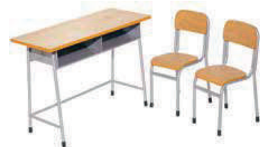
Desk: 900*380*550mm Chair: 270*270*300/560mm