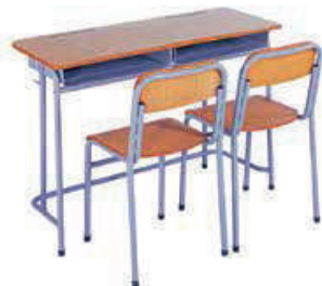
Desk: 1100*400*750mm Chair: 360*360*440mm