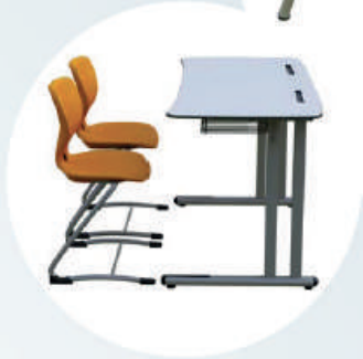
Model N 03