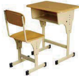
Desk: 600*420*600- 750mm Chair: 360*360*340- 440mm