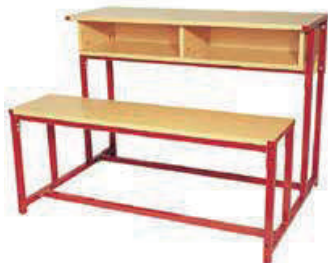
Desk: 1050*360*750mm Chair: 1050*265*440mm