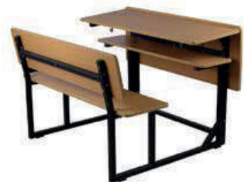
Desk: 1100*400*750mm Chair: 1100*300*440mm