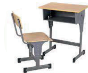
Desk: 600*400*600- 750mm Chair: 360*360*340- 440mm