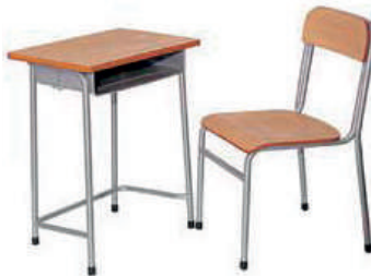
Desk: 600*400*750mm Chair: 360*360*440mm