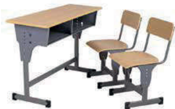
Desk: 1100*400*600- 750mm Chair: 360*360*340- 440mm