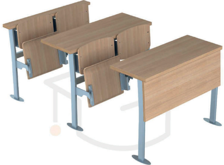
OTURMA DÜZENLERİ / SEATINGS